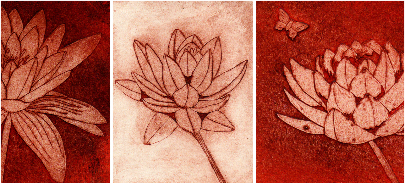
Prints by Louise Boyland; 'Waterlilies' Collographs (detail), 'Winter' Collograph (inset)